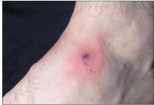
Figure 2. Representative example of skin lesions found in case 2, a macular lesion with a central purpuric and necrotic component on the ankle.

A 17-year-old male was admitted with moderate fever associated with pharyngitis and diarrhea of 10 and 3 days' duration, respectively. He also developed a transient skin rash, comprised of several erythematous macular and slightly infiltrated lesions, and a purpuric component on his lower limbs and feet ( Figure 2 ). The rest of the physical examination was unremarkable. A mild biologic inflammatory syndrome was found. A septicemia owing to N gonorrhoeae or N meningitidis was first considered, although viral lesions were also possible. The patient was given ceftriaxone sodium, 1 g, intramuscularly, that resulted in a rapid improvement of all physical signs. Direct examinations and cultures performed on blood and skin biopsy specimens remained