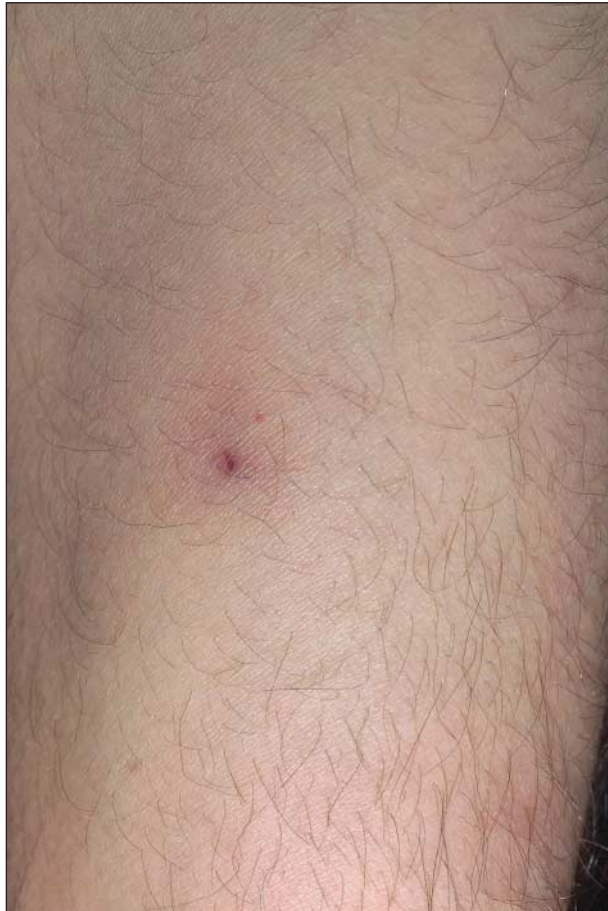
Figure 1. Representative example of the skin lesions observed in case 1. A discrete purpuric macule is observed on the forearm.

tibiotherapy combining ceftriaxone sodium, 2 g, and doxycycline, 100 mg, daily was started. The patient's status dramatically improved, and he was clear of symptoms 48 hours later. Both blood and synovial liquid culture findings remained negative. Repeated serologic tests for Rickettsia conorii were negative too. Using PCR, we searched for N meningitidis on a skin lesion; the test was positive after the patient's discharge from the hospital and thus confirmed our clinical suspicion. Using a PCR-based genogrouping method, we were also able to identify a serogroup B strain. Prophylactic treatment was initiated in all contact subjects.